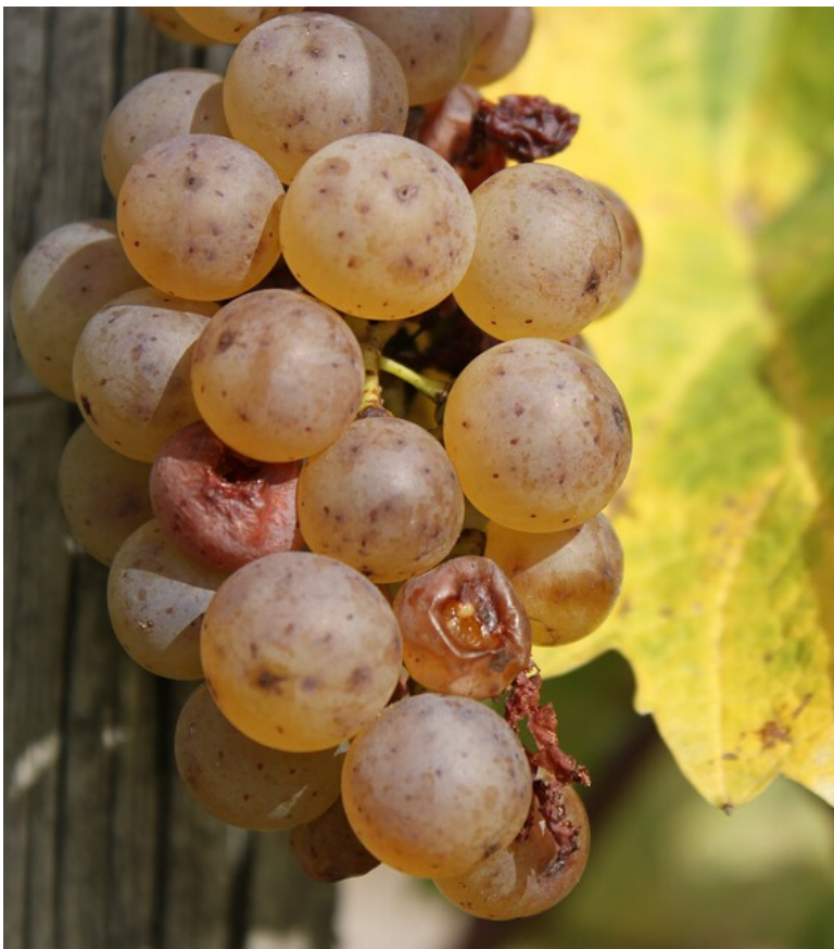
*Riesling bunch with botrytis rot (noble rot)